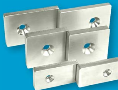
ASS - Split Strikes/Replacement Strike Plates