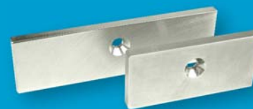
AOS - Offset Strikes/Replacement Strike Plates