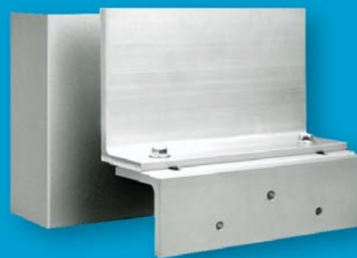
ZA - Z Bracket Kits - Adjustable